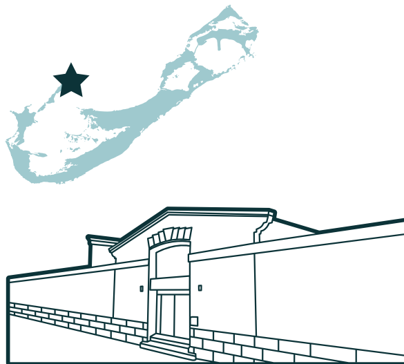
Maritime Lane, Bermuda

The Bermuda Sailors' Home ("BSH") is a registered charity, whose purpose is "to provide recreation centres and homes for and the promotion of the happiness and wellbeing of all seafarers".